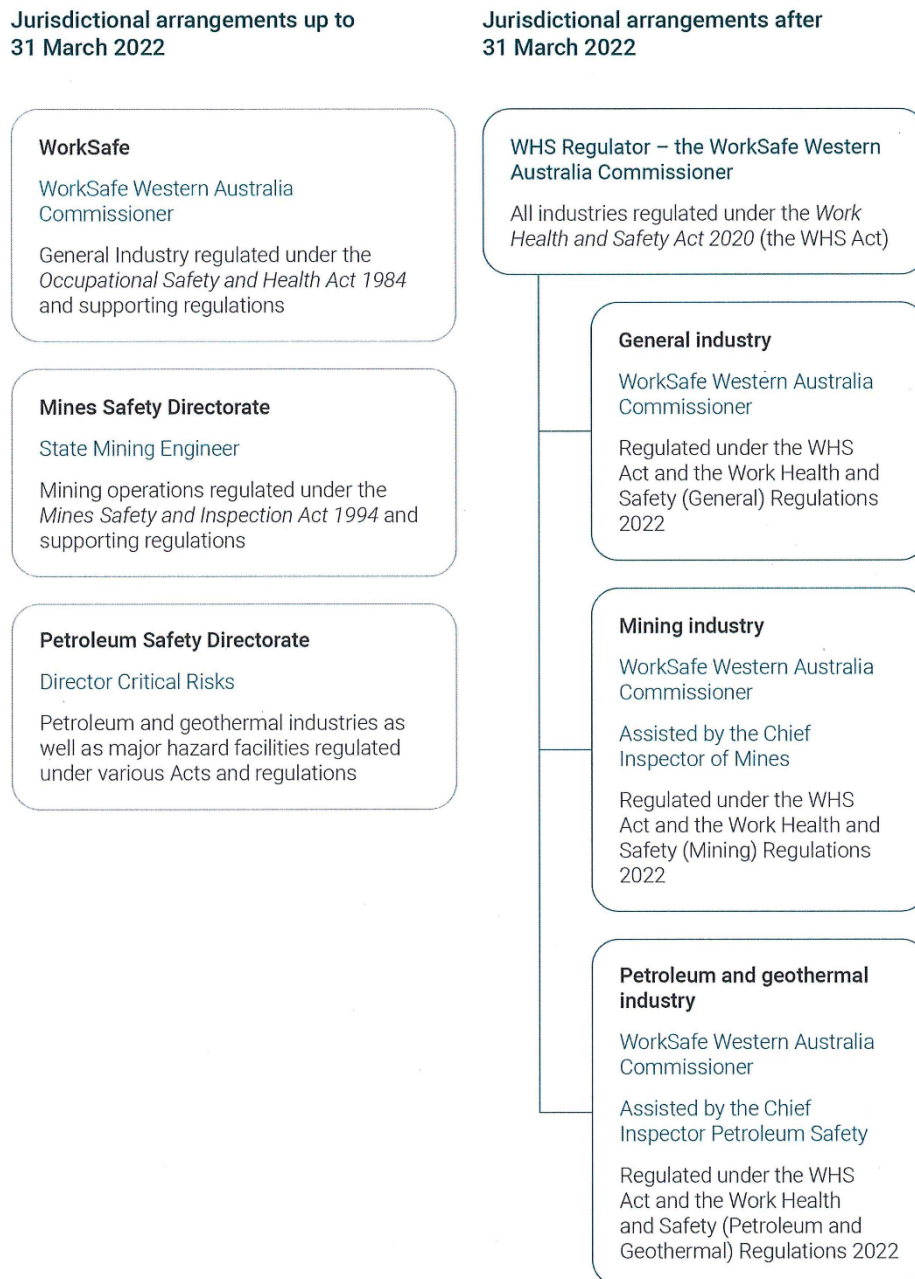
Figure 6.2: WA WHS regulatory framework 493